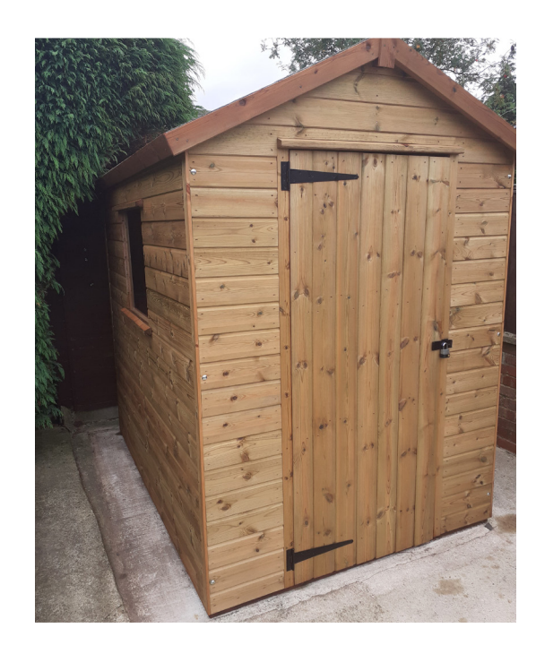
6ft x 4ft Apex £595.00

If you need a specific size, please get in touch.