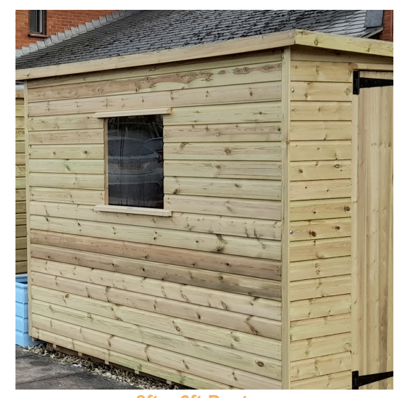
8ft x 6ft Pent £895.00