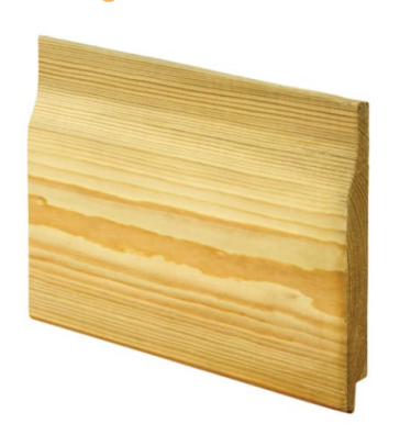
Shiplap - Pressure Treated