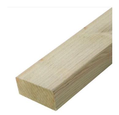
CLS Indoor Timber - untreated