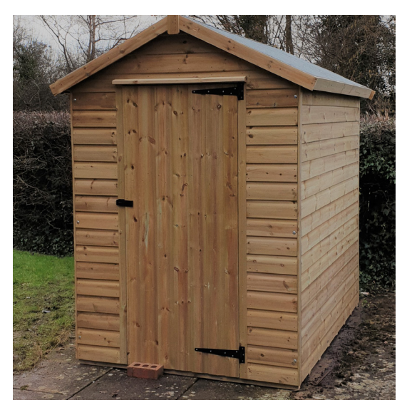
7ft x 5ft Apex £795.00