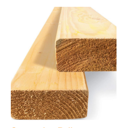
Sizes and Prices