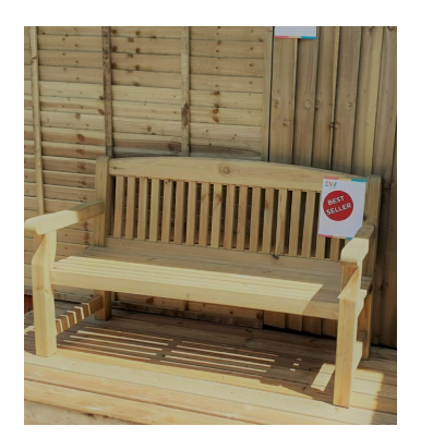
3 Seater Bench