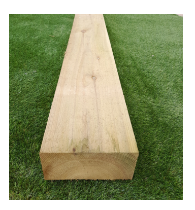
Sizes and Prices