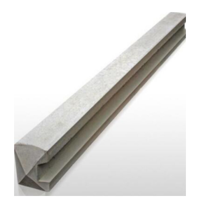
Slotted End Post