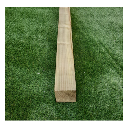
Pressure Treated Posts