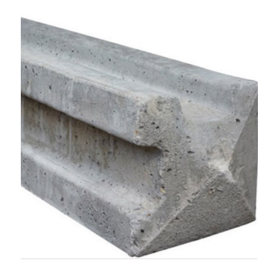
Sizes and Prices