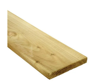
Sizes and Prices