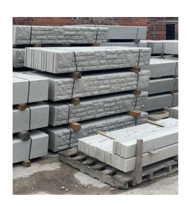
Sizes and Prices