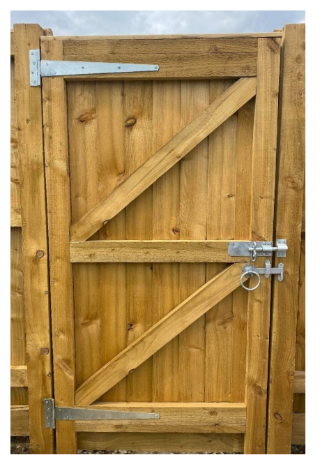
Close Board Gates